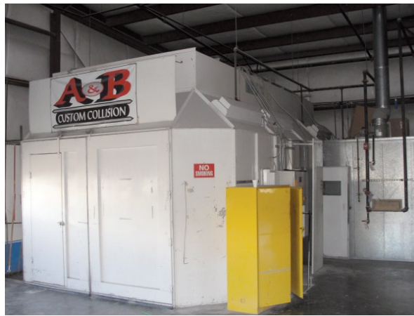
top row: Partial view Borroughs slide out parts bins; Blowtherm Ultra Prep Station; 1988 Chevy S-10 Pick Up second row: GM MDI with Panasonic Tough Book MDI computer; Partial view twin post surface mounted hoists