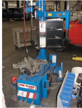
Coats Rim Clamp model 7065AX