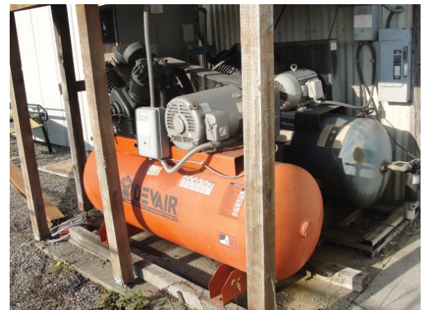
third row: Executive office suite; Blowtherm custom air spray booth; DeVair 15 hp air compressor, Challenger 10 hp air compressor