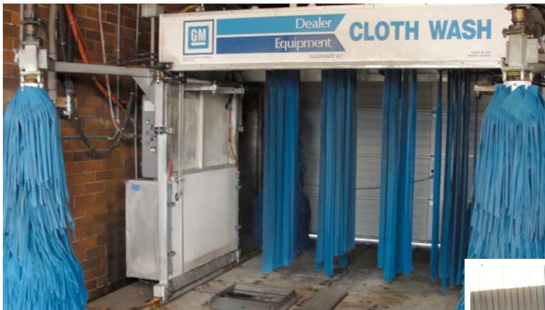
left: Broadway Cloth Wash Model 0788